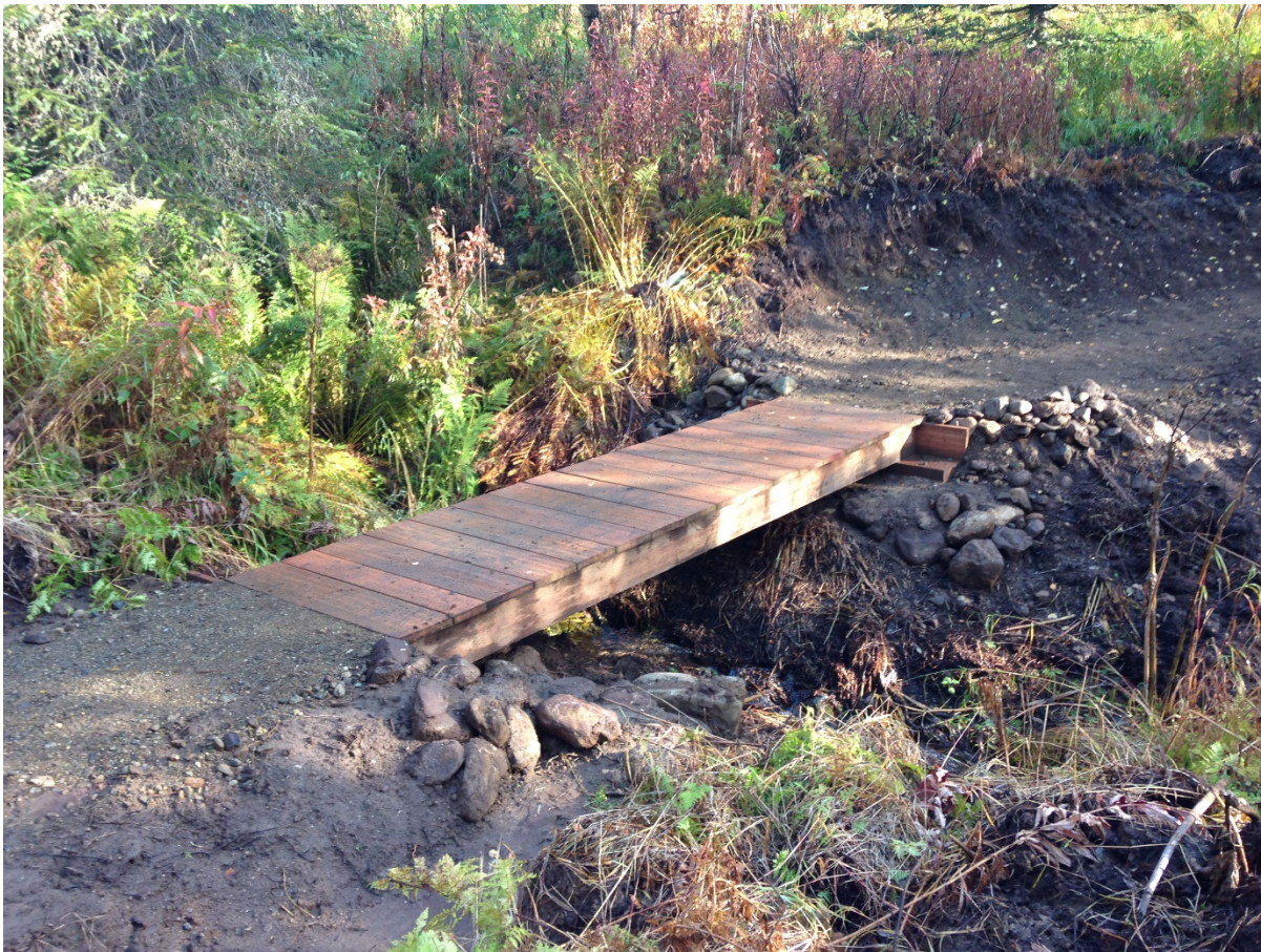
Trail Bridge at Government Peak Recreation Area, Palmer

We recommend three bridge structures, each 20 feet long. These structures can be supported by helical pilings, framed and decked with treated wood. An engineer's stamp may be required for the design.