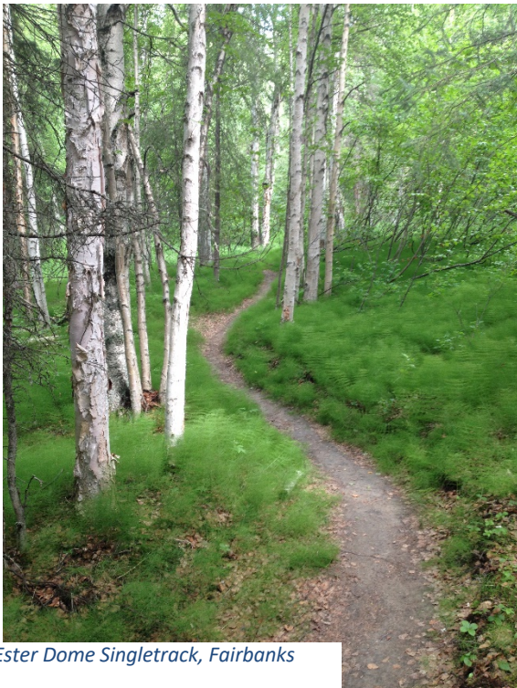
Ester Dome Singletrack, Fairbanks

The Meadow Lakes Community Council recently received title to an additional 40 acres south of the parcel that currently features the Meadow Lakes Senior Center and a community park. The MLCC would like to construct a small network of natural-surface, non-motorized recreational trails on the eastern side of the north 40 acres and throughout the south 40 acres .